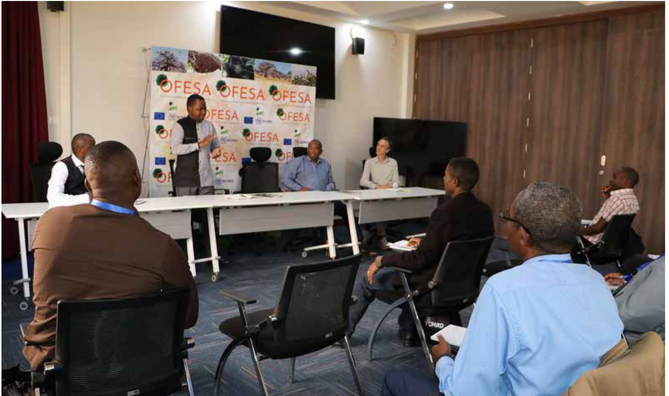
Opening session on the use of GIS and remote sensing technology for forest monitoring.