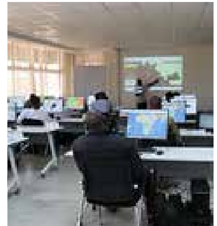
Opening session and training on GIS and remote sensing technology for forest monitoring and management.