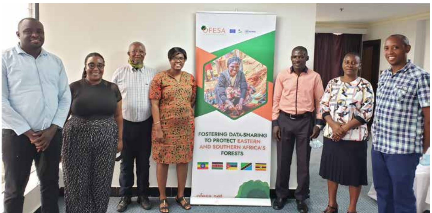
OFESA Tanzania country workshop.

Since 2020, the Forest Observatory of East and Southern Africa (OFESA), an ongoing project led by the Center for International Forestry Research (CIFOR) , has been working on an up-to-date and reliable system to help countries monitor and report on their climate obligations. To that end, CIFOR is developing a sustainable data-sharing governance framework and building capacity in the management and use of environmental information.