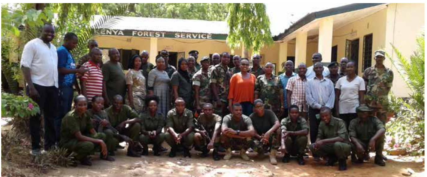
Kenya Forest Service training on low-cost forest monitoring.